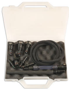
Pneumatic Diesel Bleeding Kit | 7174